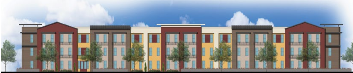
(N) Flora Street Concept Elevation