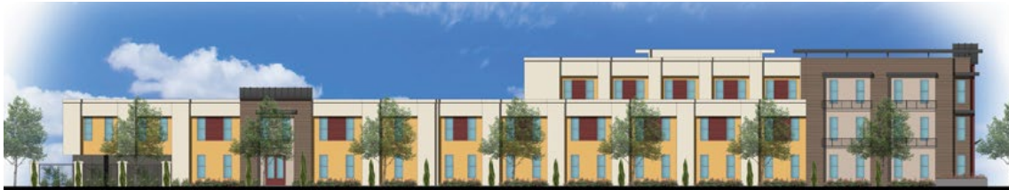
(N) North Hunter Street Concept Elevation

We are so honored to be building Liberty Square, located at North Hunter and Flora Streets in midtown Stockton.