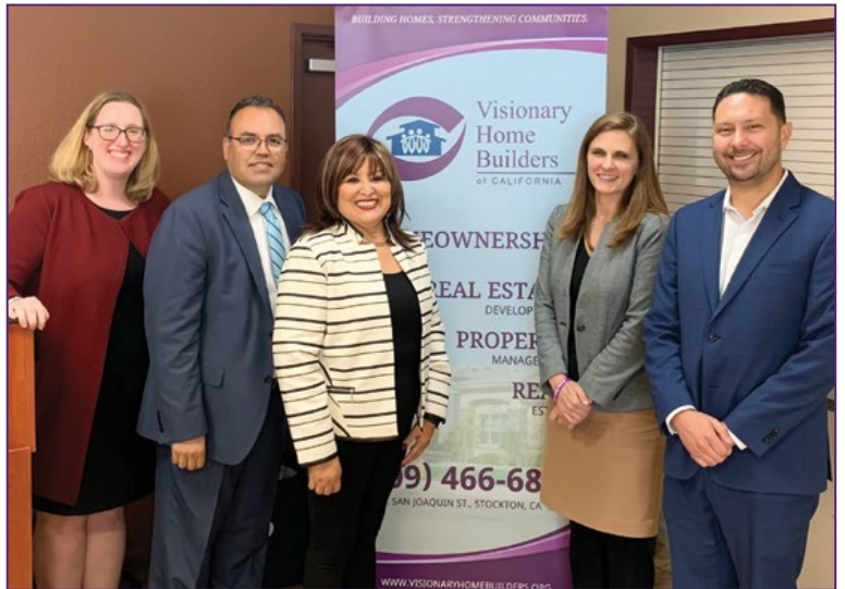
Along with UnidosUS, we hosted a community event at Diamond Cove II to educate business owners and residents within San Joaquin County on the CalSavers Program, which is funded through the State. CalSavers is designed to provide retirement plan options for workers who do not have access to an employer sponsored retirement savings plan. For further information on CalSavers, please go to CalSavers.com .