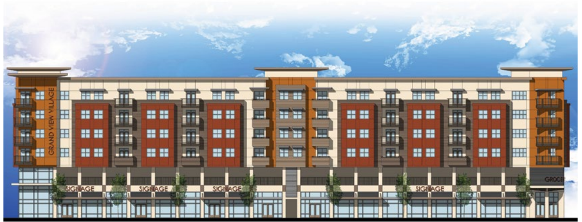
Miner Avenue Elevation

The Grand View Village project, located at Miner and San Joaquin Streets, is a welcomed addition to the revitalization of downtown Stockton.